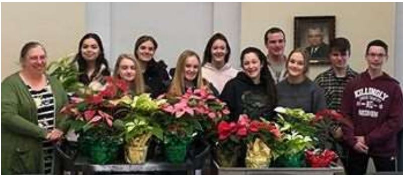
Killingly High School Students Deliver Holiday Cheer to Rose